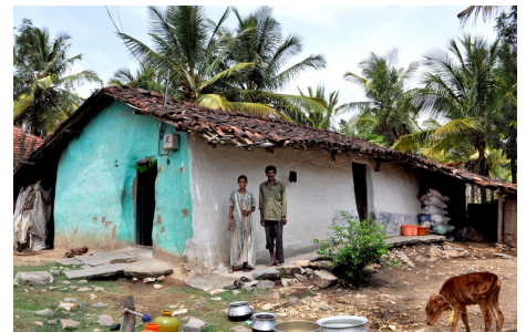
Biogas flows directly from the digester through the cable into the house. This couple is very happy with its biogas plant.