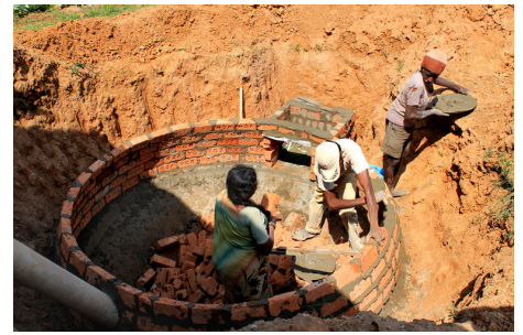
Beneficiaries constructing the digester with help of bricklayers of SKG.

Because the time-consuming collection of firewood is no longer necessary, children have more time to go to school and do homework. This gives each family almost 1.4 hours of additional time per day.