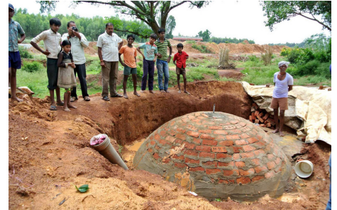
The biogas digesters use a simple, but effective and well tested technology.